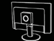
or LCD mount