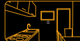
In your kitchen...