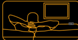
In your living room...